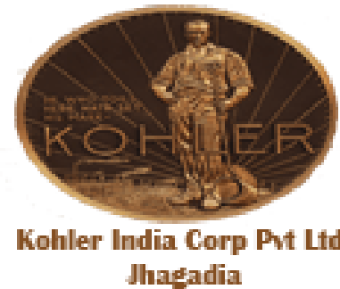
Kohler India Corp. Pvt. Ltd. (Jhagadia Bharuch)