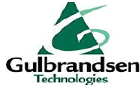
Gulbrandsen Technologies Pvt Ltd (Jhagadia Bharuch)