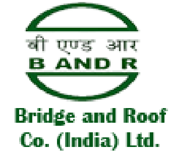
Bridge and Roof Company (India) Limited