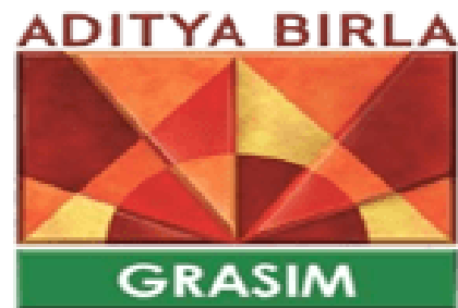
Grasim Industries Ltd. (Villayat Bharuch)